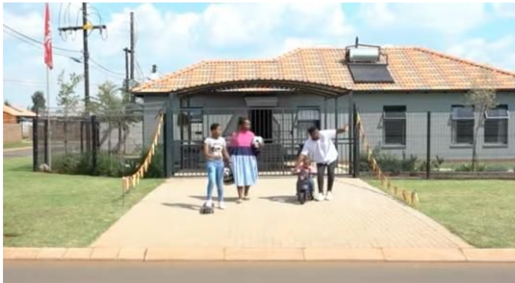
Web Ref Protea Glen

The Stables Office Park 3Ateljee Street Randpark Ridge